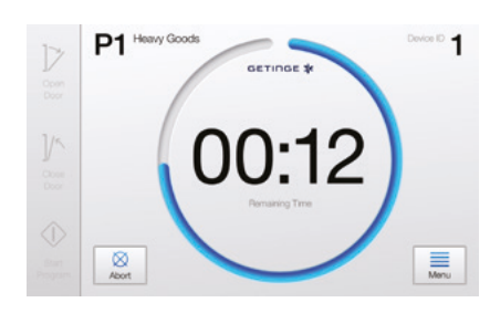
Status at a glance: easy to see the time remaining, even from a distance.

Large 10-inch high-resolution screens are easy to read and monitor, even at a distance. These screens display the most critical process information clearly and logically, including remaining cycle time and start-up selections.