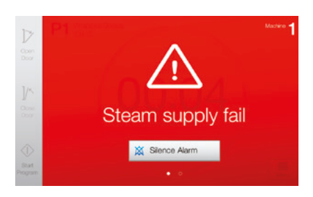
Every triggered alarm comes with clear on-screen directions for what action to take.

Solve problems or access advanced features directly from the clear, easy-to-understand user interface.