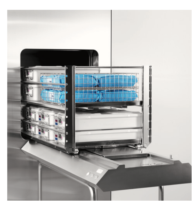
Automatic loader and unloader for shelf racks (GL64SR).