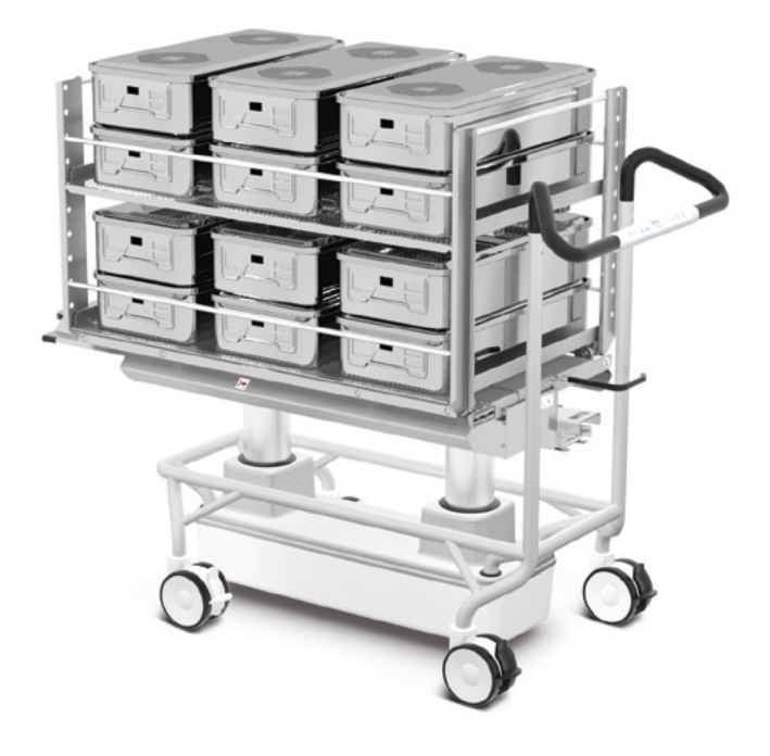
Smart AHT loading/unloading trolleys.

Getinge's innovative, automatic, one-point loading solution improves throughput for CSSDs with multiple sterilizers. The moment a sterilizer is free, a new load is automatically picked up and loaded – providing maximum availability and full resource utilization.