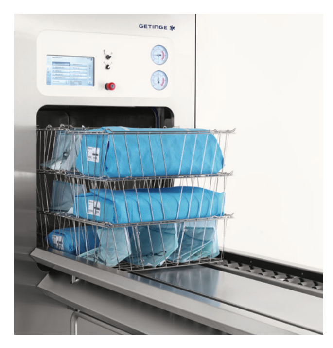
Automatic loader and unloader for baskets (GL64B).

We offer complete, efficient, economical, and ergonomic handling systems for baskets as well as containers. Whether automatic or manual, we tailor every detail to make work easier and more efficient for every CSSD, whether you have one sterilizer or ten.